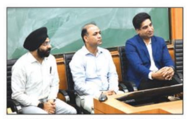
Officials during a programme organized by IIM Jammu.