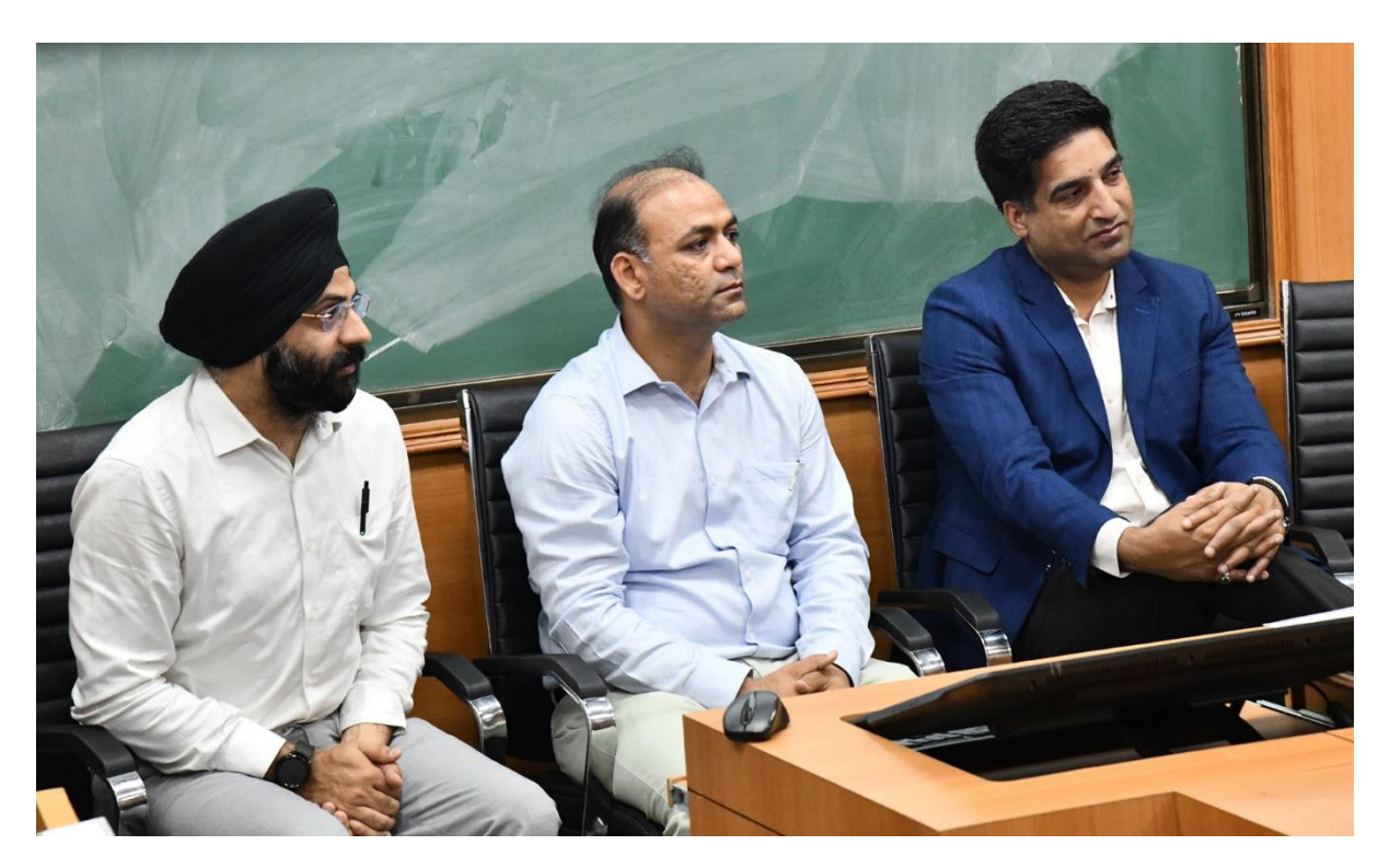
Friday, 5 July 2024- Web Version